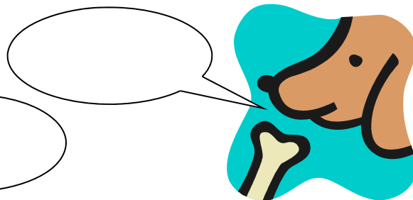
What your dog says when you ask him to "Speak"

Kids ... What sound can you think of that describes your credit union?