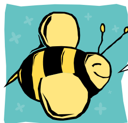
The sound of busy bees

Kids ... Lots of words are "imitative" — they are our version of a sound we hear. Onomatopoeia is an ancient Greek word that means to "make a name". Write in the word made from a sound for each of the pictures.