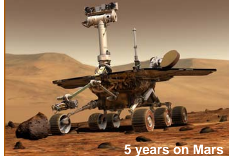
5 years on Mars

Spirit and Opportunity arrived on Mars in January of 2004. The rovers have provided us with an astonishing amount of knowledge. We now know a lot about the history and geology of the Red Planet.